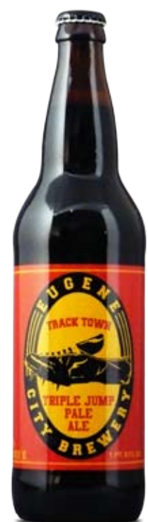
Pacific NW Champ