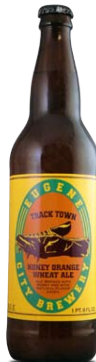
Pacific NW Champ